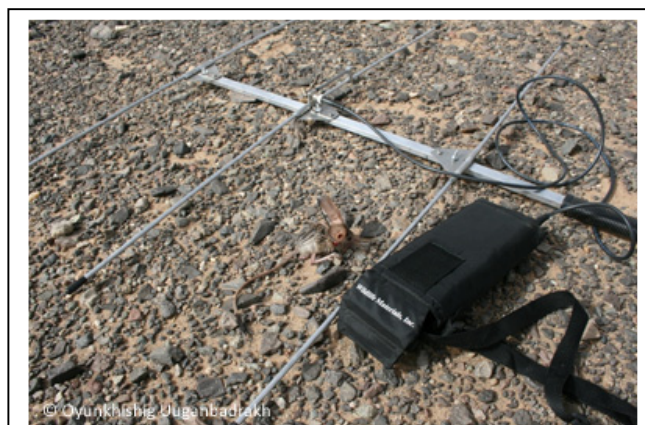
Figure 2. A radio antenna manufactured by TRACKUS Ilc, Birmingham, UK

Dr. Seretse Khama Ian Khama has established a programme of tracking