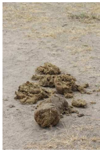
Figure 3. Elephant fecal matter, which is very similar to the fecal matter of Hippopotamus amphibious.

Each mating event will be recorded and filmed using a handheld digital camera. After mating is finished, we will continue to track the female individual until she defecates, and will sample the fecal matter. This fecal matter will be returned to the lab for fecal endocrine analysis using the methodology of Graham et al. (2002), (Figure 3).