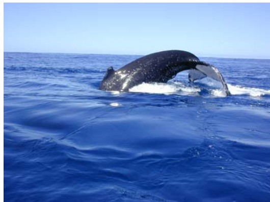
Photo 2. A humpback whale in the PMM.