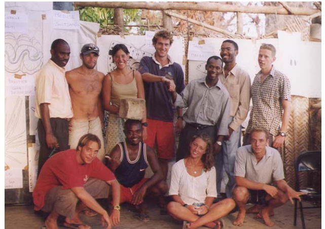
Photo 1, showing the team after a workshop held for college students at Nioumachoua.

EUCARE sent survey teams of divers to collect baseline data fish 7 , corals 8 and invertebrates 9,10 . The EUCARE underwater survey technique was modified to work in a quantitative methodology used by AIDE scientists, through the Commission de l’Océan Indien (COI) 11 . The methodologies used were Line Intercept Transects, Live Fish Censuses and the EUCARE Underwater Survey Technique 12 . This allowed the data to be included in any long-term studies that AIDE may carry out in the area. The modification allowed the team to complete its aims and enhanced the sustainability of coral reef health