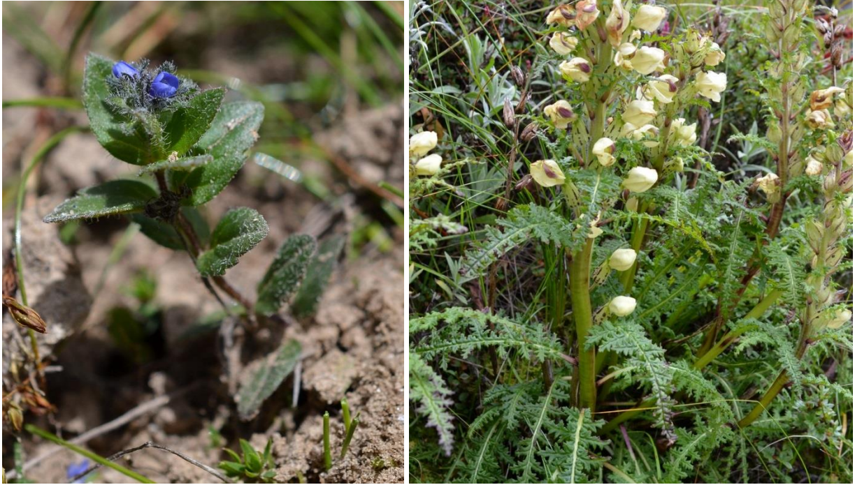
Fig. 5. Veronica cephalodes , Pedicularis sculliana