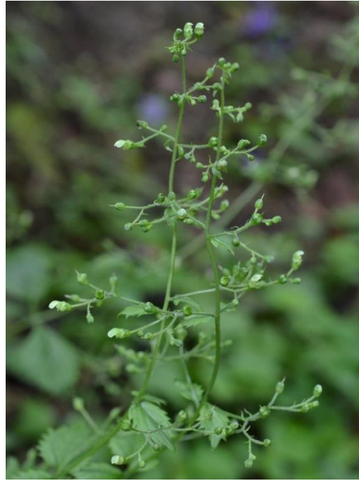
Fig. 3. Lindenbergia indica , Scrophularia urticifolia