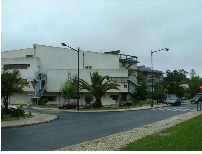
Figure 1 Lisbon University

Presentations covered areas such as fungal processes, fungal plant pathogens, 3D imaging of cells, endocytosis in plants, root hair tip growth in plants.