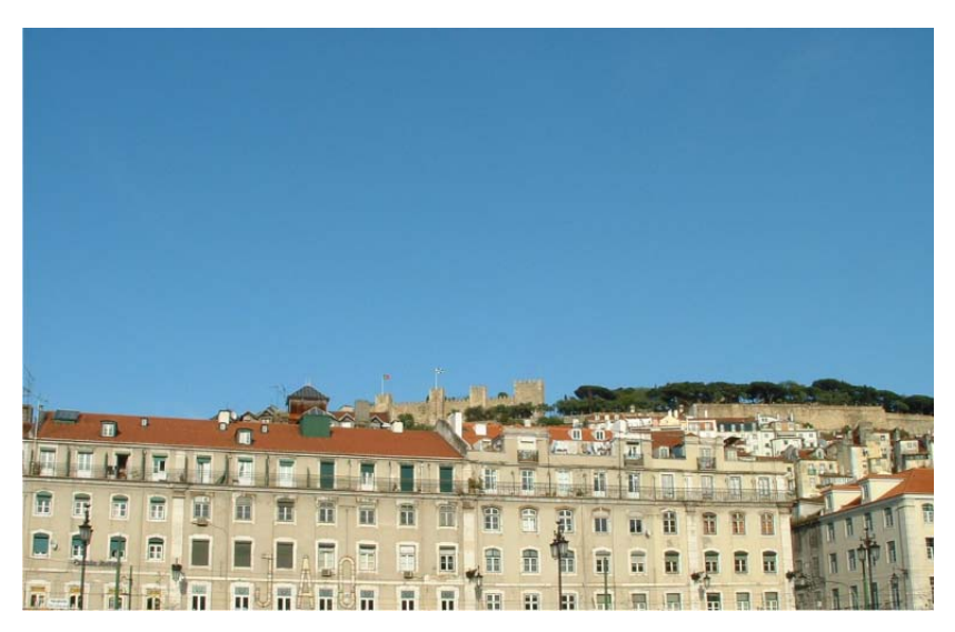
Figure 4 Castle overlooking Lisbon

The Moors built the Castle in the ninth century and the site was once a Roman outpost. When the Portuguese re-conquered Lisbon, the castle was turned into a royal palace. Many of Portugal's most important historical events have taken place within the Castle's walls. Kings have been born here, and Vasgo da Gama was received at the castle after his historic voyage to India.