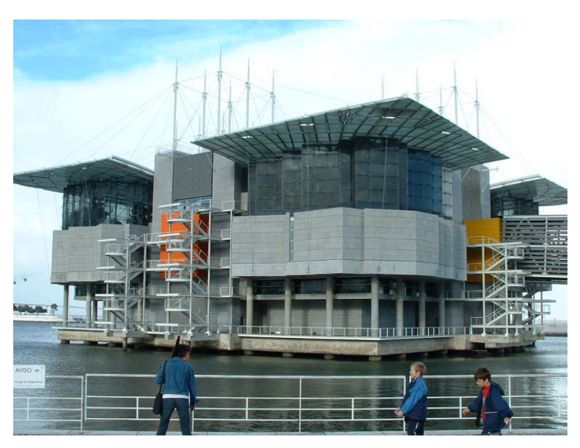
Figure 3Oceanarium in Lisbon

The second largest aquarium in the world was built in Lisbon for the Expo 1998. It has a stunning display of many different sea animals. Both this and the Parque das Nações that surrounds it were definitely worth the visit.