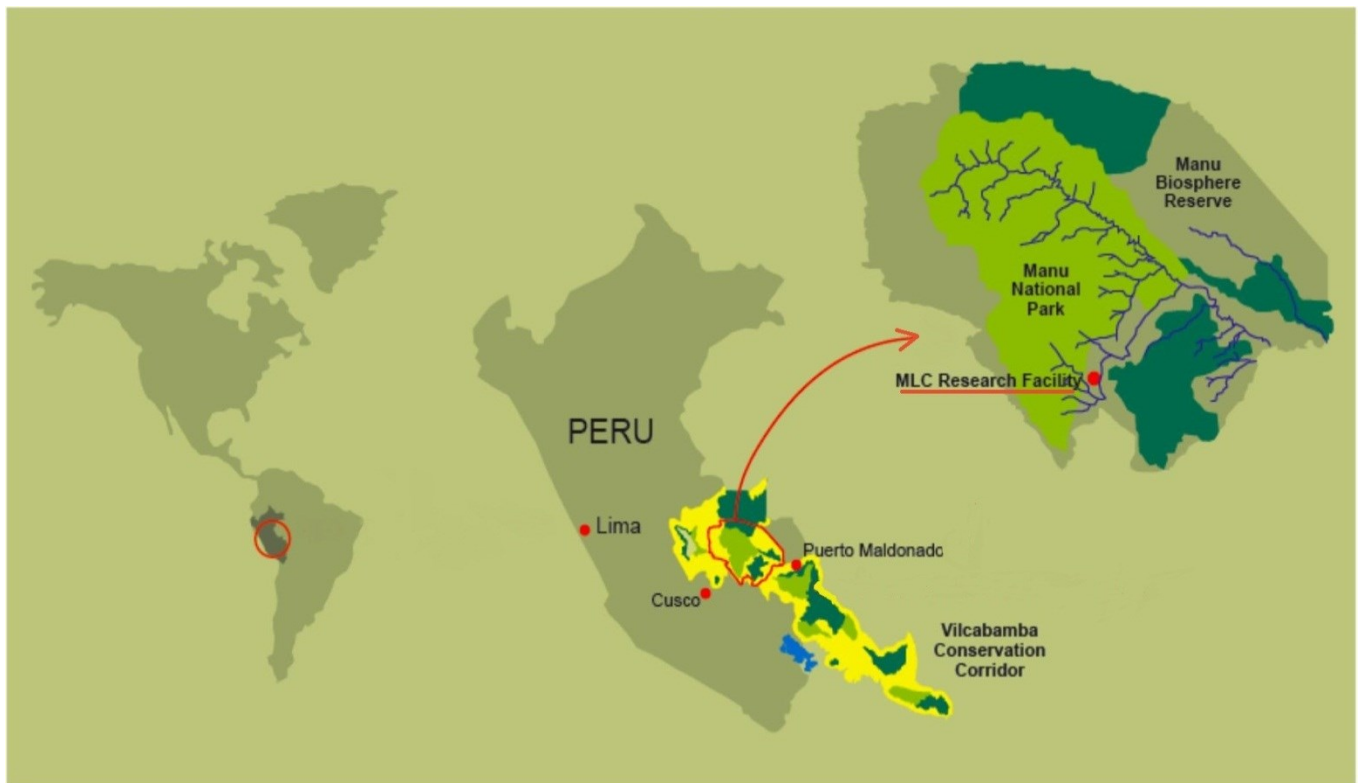
Figure 1: [1] The Manu Learning centre is located in the cultural zone of the Manu National Park

Peru is situated on the western coast of South America. Approximately 53% of Peru is covered by forest 2 . The range of altitudes created by the ridge of the Andes creates an impressive variety of habitats ranging from cloud forest to mountainous terrain. Peru is rich in biodiversity, and is home to around 551 threatened species 2 . It also contains a significant portion of the Amazon rainforest, with the second greatest share of the forest after Brazil. Regardless of the richness of biodiversity, Peru has a low GDP per capita at 4403.1 (2009 estimate) and around 10% of the population is employed in agriculture 2 .